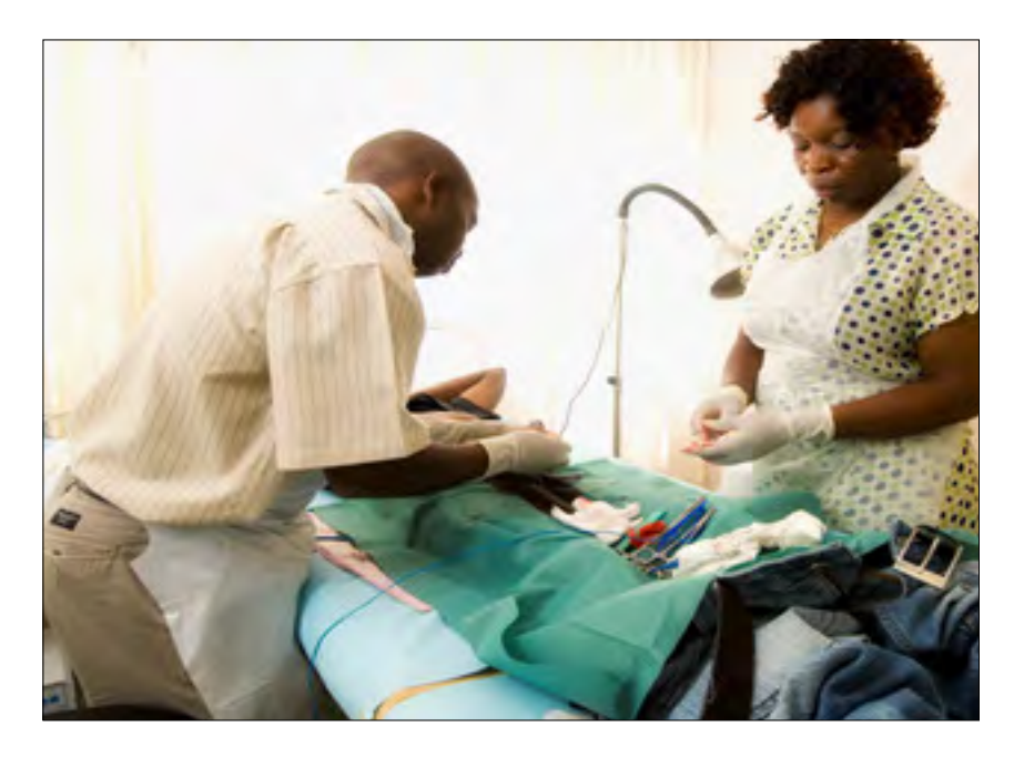
A young man undergoing male circumcision