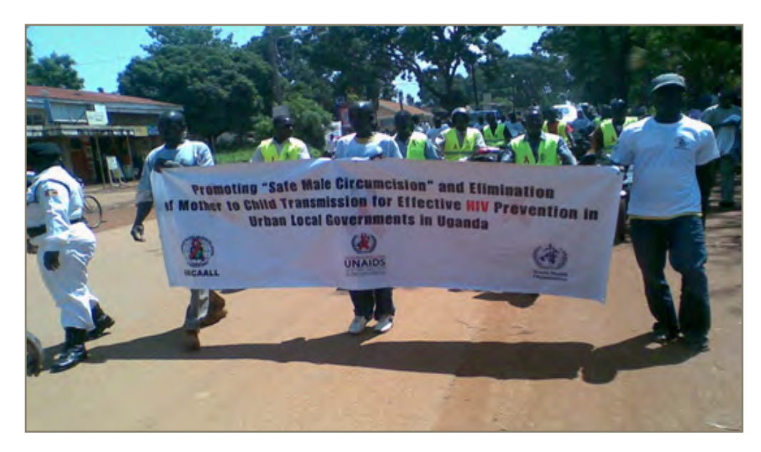
Community mobilization for Safe Male Circumcision by a Civil Society Organization (CSO)

Eleven countries (all except Lesotho, Namibia and Tanzania) reported varying approaches for involving grassroots organizations and networks in VMMC scale-up. These included information dissemination; involvement of community leaders and religious leaders; training and sensitization; and use of community mobilizers, existing community structures, health workers, schools, community outreach teams, various district and village committees and community-based organizations (Table 10).