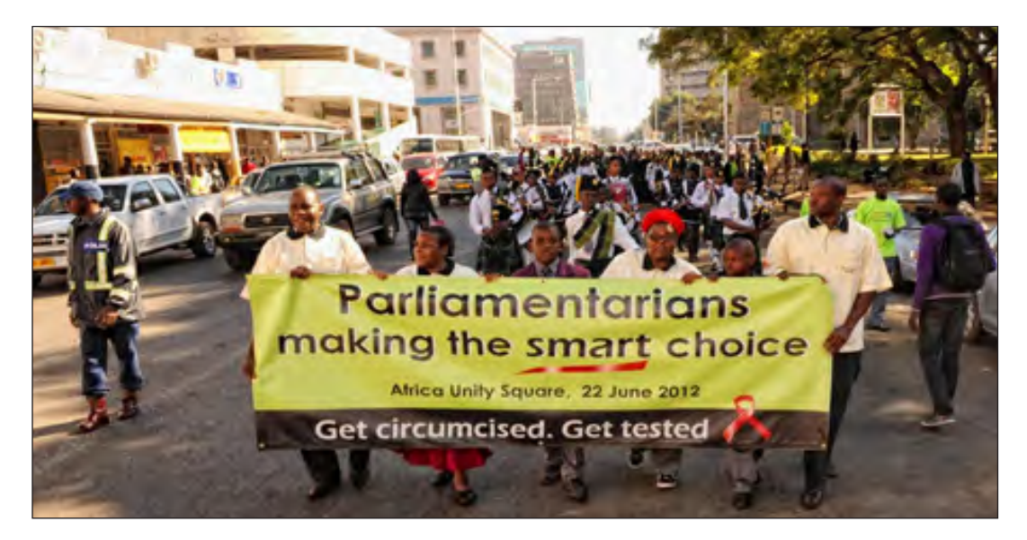
March in support of Members of Parliament making the choice to undergo VMMC