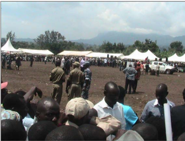
The mammoth crowd that turned up on Aug 3 2012 (official launch of the Imbalu Year).