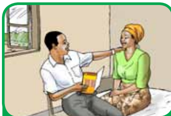
Banja kukambirana za mdulidwe