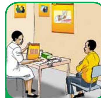
Abambo kulandira uphungu wa mdulidwe