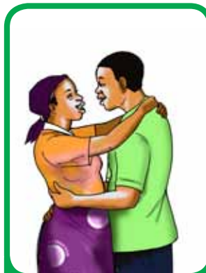
Kukhulupirika kwa okonedwa m'modzi

Kuti mutetezeke ndi kuteteza wokonedwa wanu ku HIV: