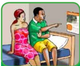
Kukambirana za nthawi yoyambanso kugonana potsatira mdulidwe