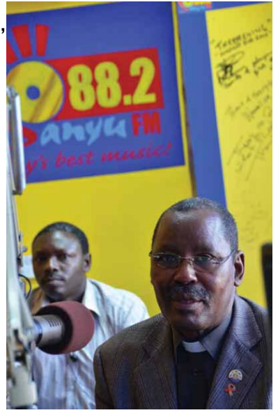
A leading religious figure during a radio discussion