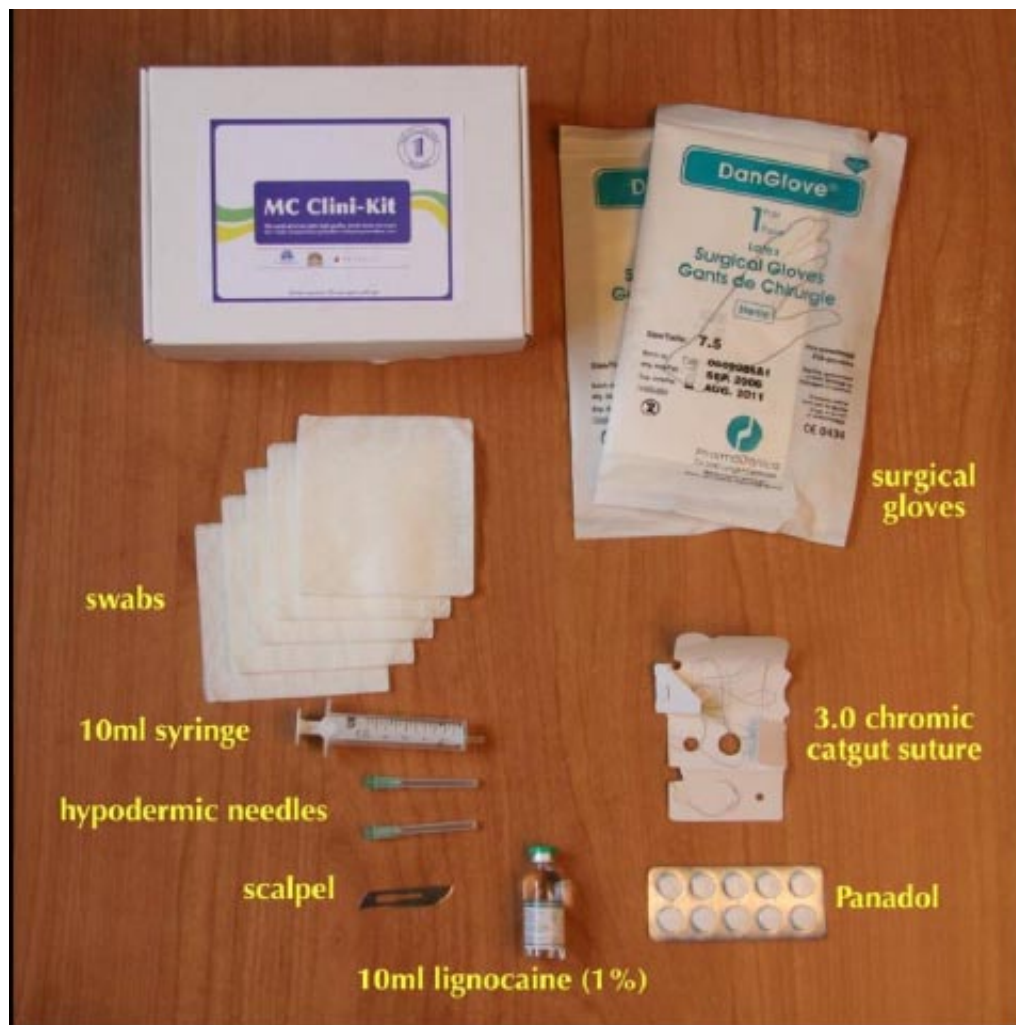
FIGURE 3. MALE CIRCUMCISION KIT (PSI).

The cost of the kit is US$5.60. This price might be lowered, as $0.90 of this is for shipping and packaging (labour included), and this seems high. After use of the kit in practice, changes are anticipated for version two (Figure 3). For example, the kit currently contains three days of panadol, but more is needed because painful morning erections begin soon after surgery. The type and numbers of pairs of gloves proved an unanticipated obstacle, as the size of glove is important to the surgeon and with a kit one must supply appropriately-sized gloves. And, if the kit is to supply gloves for the assistant, one does not know these sizes, either. Currently, the kit contains one pair of big and one pair of little gloves, but this may not be a sufficient number for both surgeon and assistant(s).